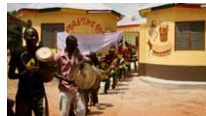
Bizung School of Music and Dance, Tamale, Ghana

Playing for Change is a multimedia movement created to inspire, connect, and bring peace to the world through music. The true measure of any movement is what it gives back to the people. The Playing For Change Foundation is dedicated to building music and art schools for children around the world, and creating hope and inspiration for the future of our planet. As of today there are 9 programs in Africa and Asia, 700 students, and 153 jobs created.